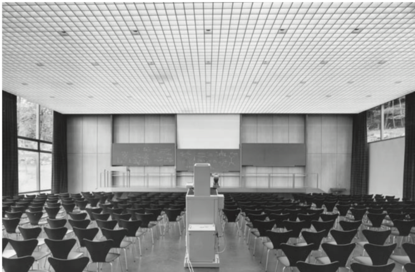
Der Hörsaal um 1965.