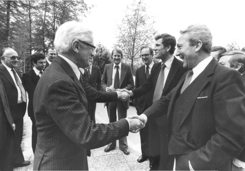
Sir John Kendrew, EMBL's first Director General, greets the then German Federal Minister for Science and Education